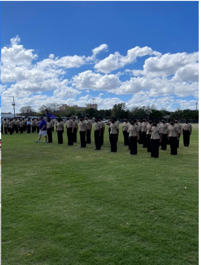
Color Guard Team